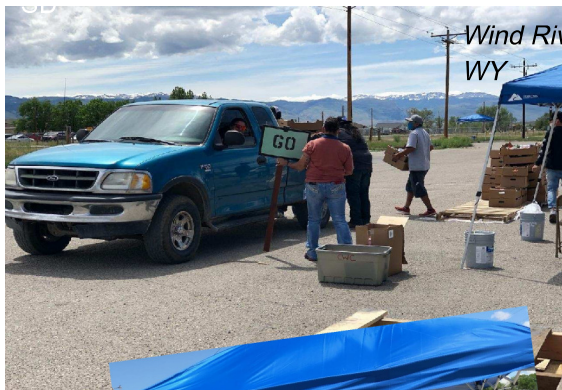
Wind River Reservation, WY