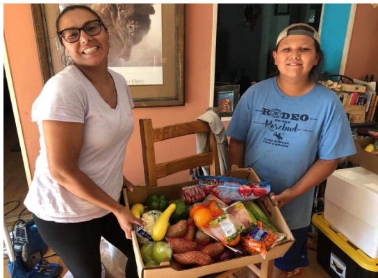
ROSEBUD RESERVATION, SD

Feeding the Nations through our partnership with World Vision and the USDA.